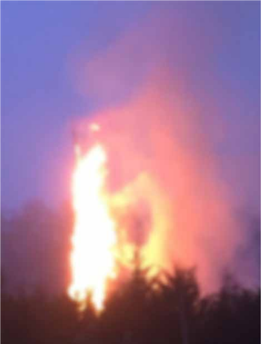
Source: Adapted from KPIX 5 (CBS San Francisco), "Famed Presidio Wooden 'Spire' Sculpture Damaged By Early Tuesday Morning Fire," June 23, 2020. Image credited to San Fran Bay Man.